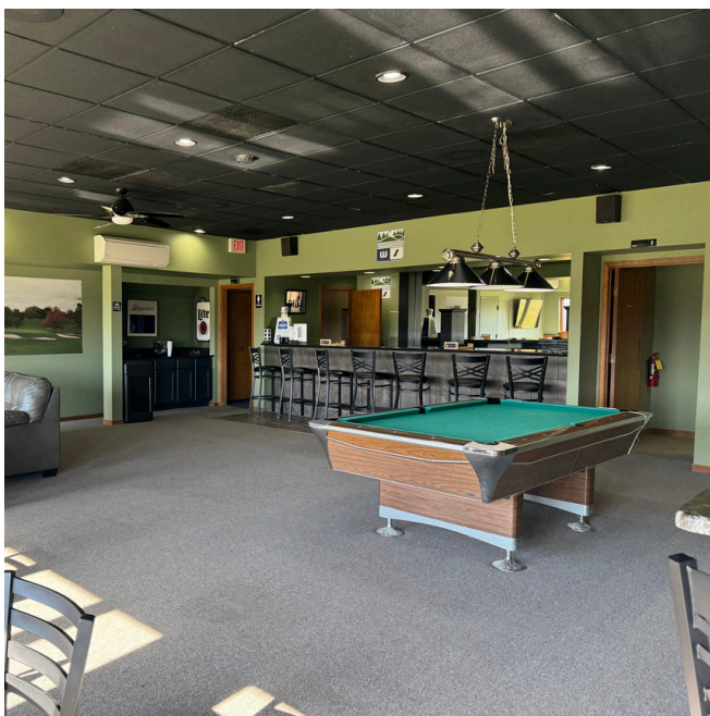
1908 Lounge accommodates up to 20 Guests