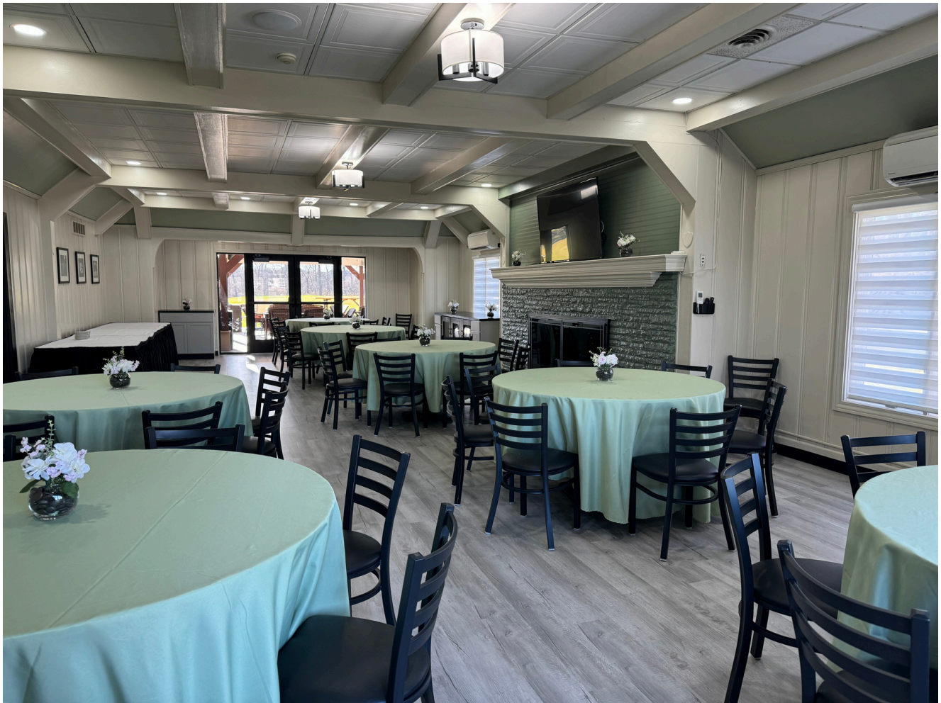
Fireplace Room accommodates up to 65 Guests