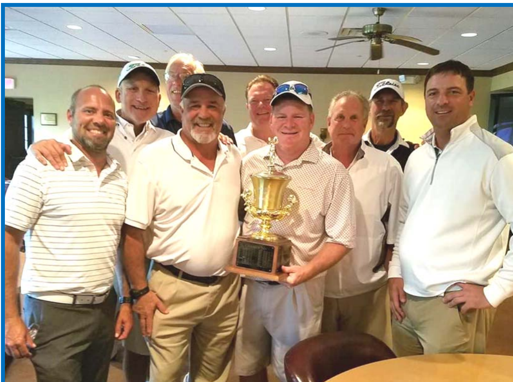
Nine of the 16 players pose with the coveted "Island Cup"