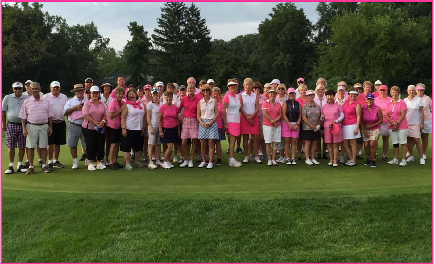
Group Photo of Rally for a Cure Outing