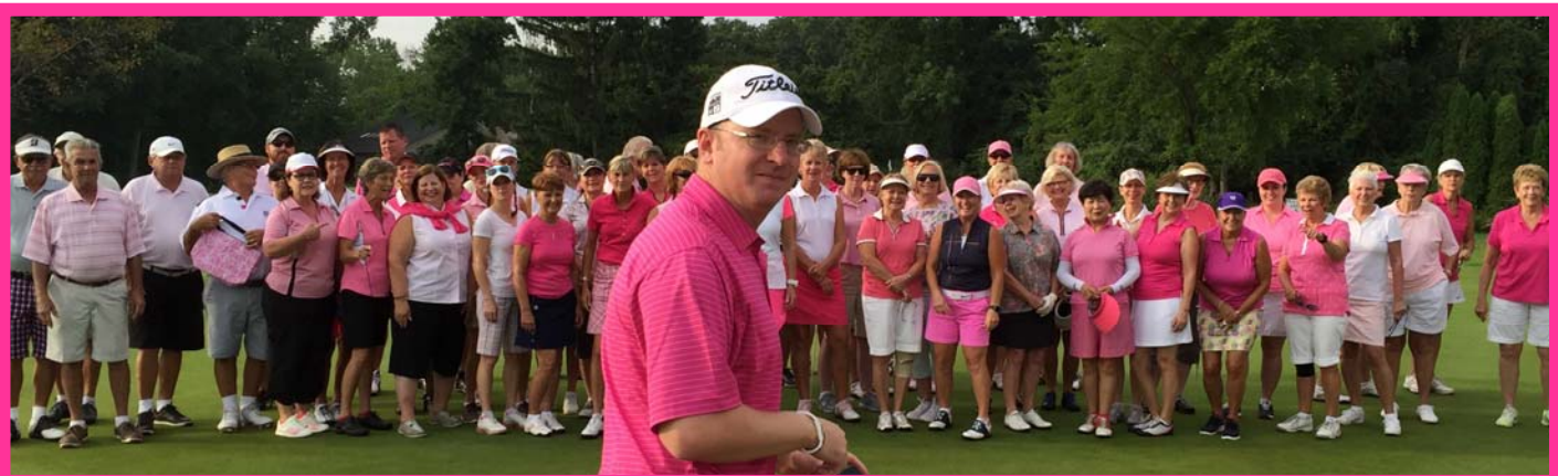
Joey Photo Bombs Group Picture of the Rally for a Cure Outing