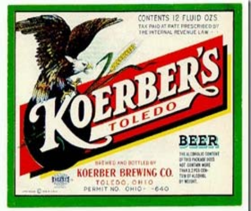
One of Koerber's Beer Bottle Labels